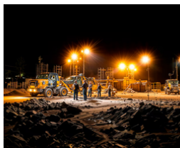
Mining area, Extreme environment: dusty, humid, Outdoor