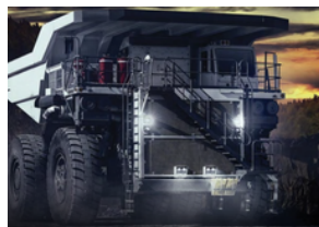
Heavy equipment (dump truck, etc.)