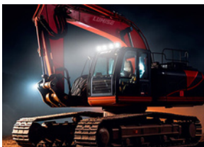
Heavy equipment (excavator)